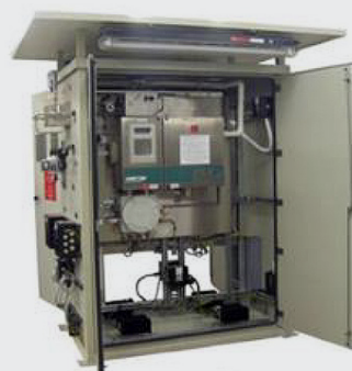
Some of the custom-built shelter and cabinet systems created by AMETEK Process Instruments